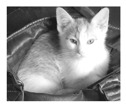
RUSTY is a frisky orange and white male kitten who loves to play with kids and other cats.