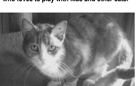
LEA is a 4 yr. old, very petite, gray and white tabby female who adores being petted.