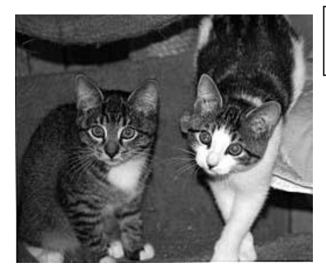
EMMA ROSE is a sweet, friendly 4 mo. old gray and white tiger with white paws.

See other wonderful cats and kittens at www.hilltophumane.org or www.petfinder.com or call 781-961-3638.