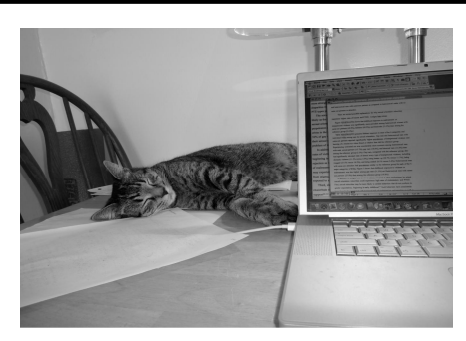
Luigi after a long day on the computer!