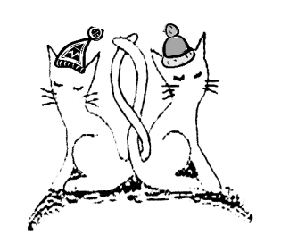
Hilltop Humane Society, Inc. A non-profit and strictly no-kill animal shelter